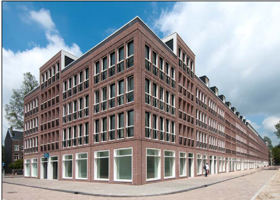
The 2011 Architecture Award from the Dutch window association VKG went to the De Keyzer project in Amsterdam. Here the profine customer Kumij BV realised K-vision windows in the colours dark green and white.