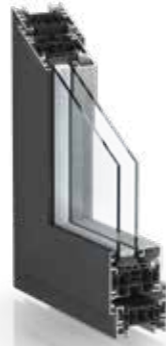
WarmCore 70 Turn