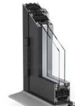
WarmCore 70 Fold