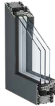
WarmCore 76 Turn