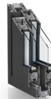
WarmCore 76 Slide

WarmCore 76 In (inward-opening) WarmCore 76 Out (outward-opening)