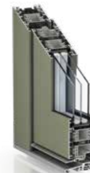
WarmCore 76 Door

Flush sash window design with no visible sash for maximum peace and quiet and more natural light.