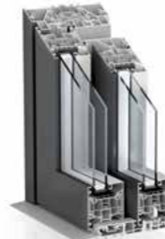
WarmCore 70 Slide