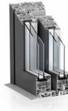
WarmCore 70 Slide

Available in 1- and 2-sash versions Various threshold designs available