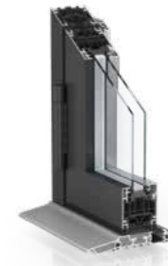
WarmCore 70 Fold