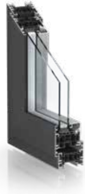
WarmCore 70 Turn